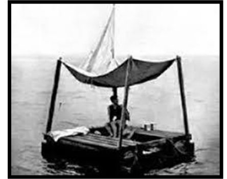
Not Terry's, but close enough.

In the last century while I was a young lad growing up in Cape Girardeau, Missouri, I was first introduced to boating. All of us young lads in the neighborhood used to explore and walk all the ditches looking for crawdads. As you know, water flows downhill and the ditches soon ran into a creek, Sloan Creek. Sloan Creek after several miles runs into the Mississippi River. I must give you a little background first, in the summer the Mississippi River floods and of course the creeks backup. Even though we were miles from the river. Sloan Creek was deep and wide, perfect for young lads who wanted to explore the Creek first with our rafts and then on to mighty Mississippi River. Our first, and my first boat was made from Styrofoam Royal Typewriter cases. All framed with 2 x 4's about 4 feet by 8 feet in total size which me and friends sailed or rafted down the creek to the Mighty Mississippi.