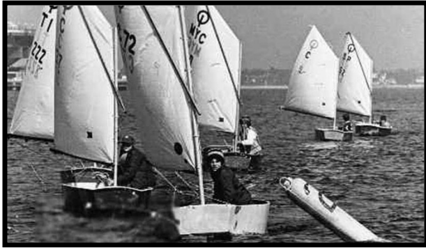
Not Terry, but it looks like Chicago.

After years of no boats, living in Chicago and being single at the time, I was just minding my own business when an apartment became available on Grass Lake in Lake Villa, IL. I took it because it was on a lake and relatively cheap. The next day I drove by a yard sale with a sailboat in the front yard. I looked at it and said why not, it was only $50.00. I also used the boat in the wintertime as my coffee table in the living room. (Remember, I was single). After I moved down to Florida, I found out it was an Optimist Pram. I sailed this on Grass Lake for a couple of years and enjoyed the heck out of it.