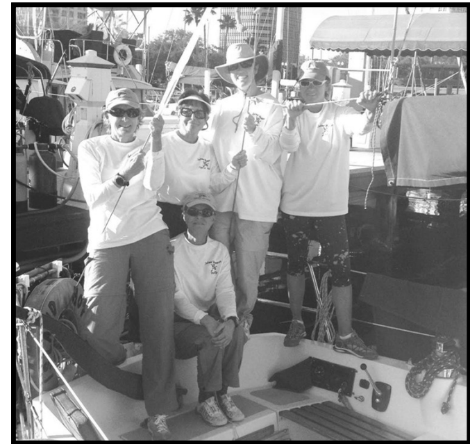
The Crew of the "Island Hopper"