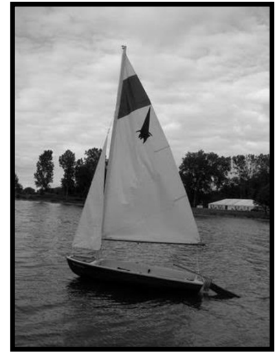
The Sea Witch...