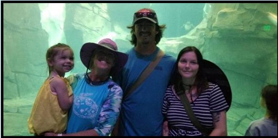
Enjoying the family...

There are so many great events that have taken place over the years within the DBC and so many great members that we have had the opportunity to meet and become friends with. We encourage all of you to GET OUT THERE AND GO BOATING!